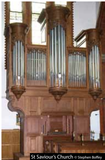
St Saviour's Church